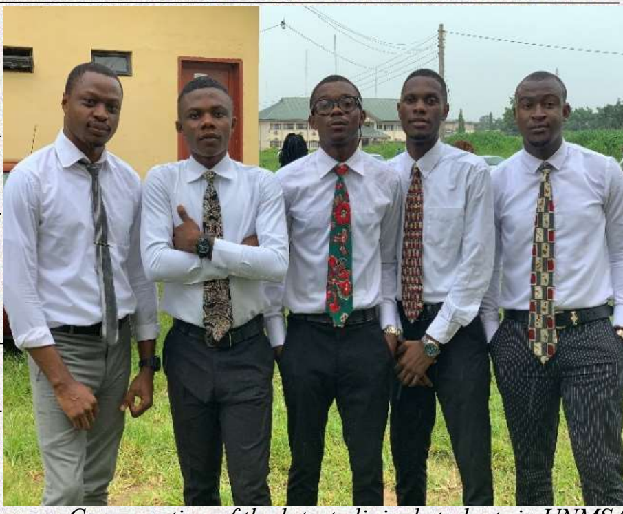
Cross-section of the latest clinical students in UNMSA

Century 21Freedom Group International--Fin. Secretary –pg 02